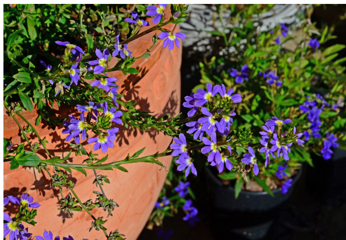
Scaevola aemula . Growing in a large pot.