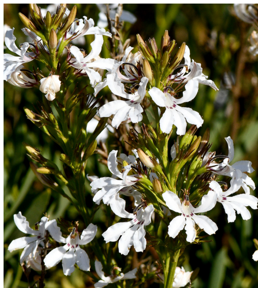
Goodenia scapigera . Growing in the Fitzgerald National Park, WA.